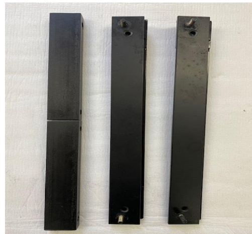
4 CONVERSION PLATES & 2x50mm SPACES